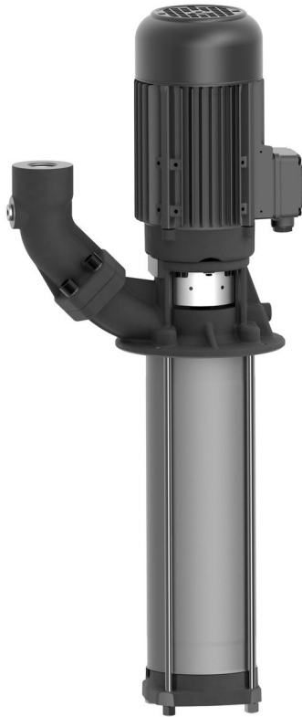
Available Extended imm. depths: 790 mm (31.10"), 890 mm (35.04")